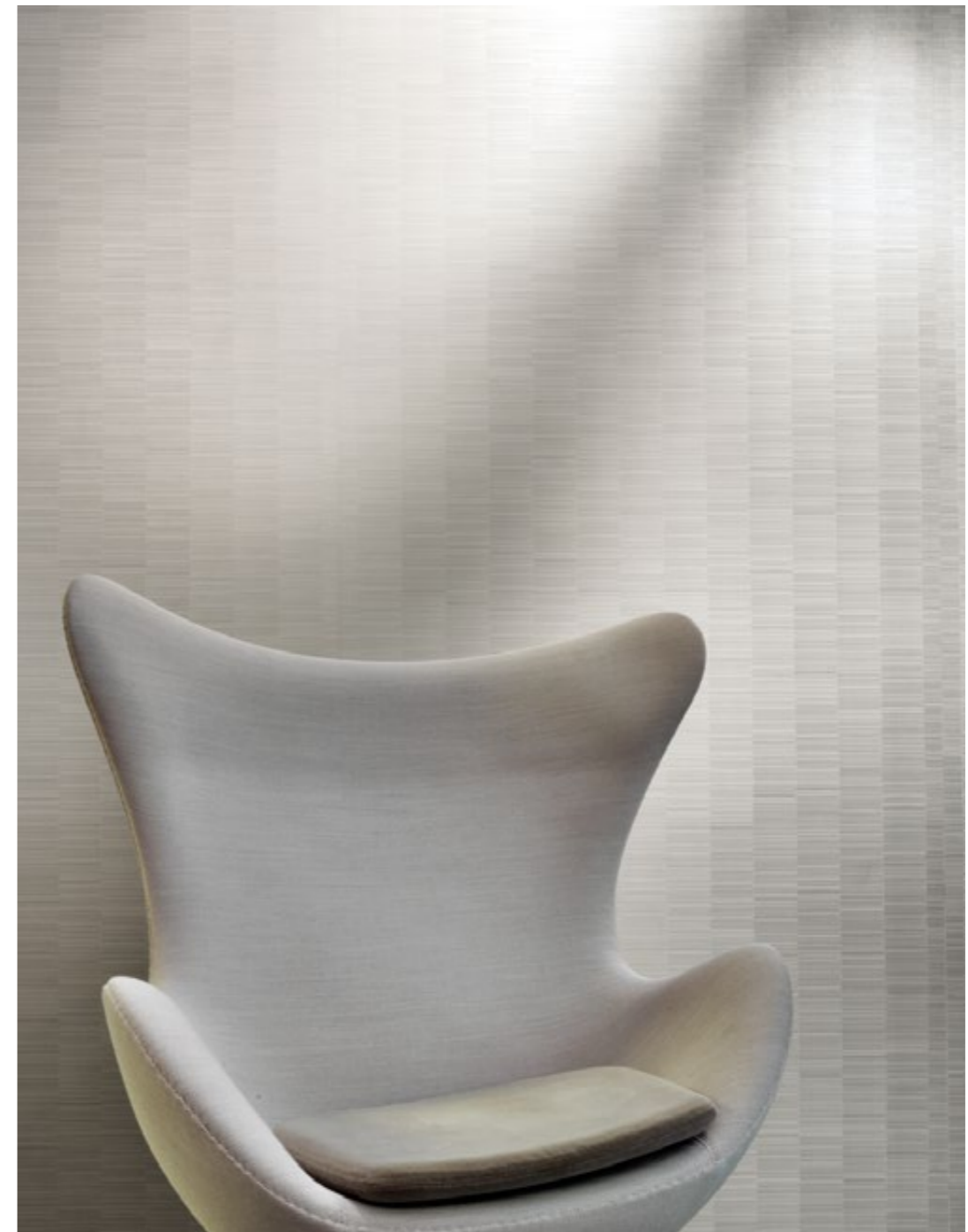
Wave Grey 100x300