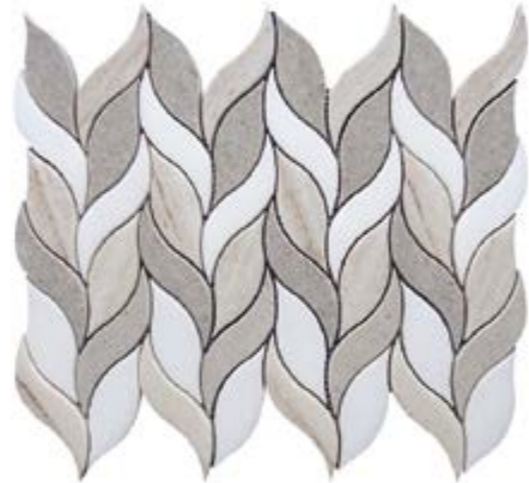
BAHARIYA Code: SAH-LF01

Sheet size: 297x307 mm Material: Crystal Sand / Athens Gray / Thassos White