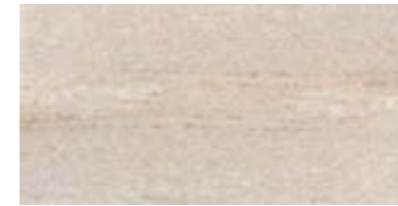
CRYSTAL SAND 3x6 HONED Code: FSH-36H