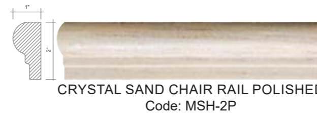
CRYSTAL SAND CHAIR RAIL POLISHED Code: MSH-2P