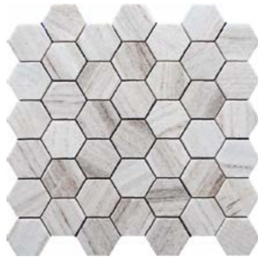
TIMBUKTU Code: SAH-G41H

Sheet size: 297x302 mm Material: Crystal Sand polished