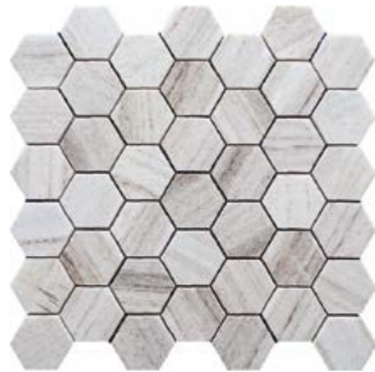
TENERE Code: SAH-G39P

Sheet size: 312x315 mm Material: Crystal Sand / Thassos White