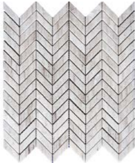
CAIRO Code: SAH-CV08

Feel the sun on your back and the sand under your feet with our Sahara collection, featuring our Crystal Sand marble. Inspired by the warmth and exoticism of the Sahara desert, this collection shines in any setting.