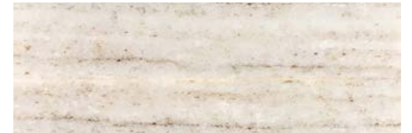
CRYSTAL SAND 4x12 HONED Code: FSH-412H Size: 100x305 mm Material: Crystal Sand honed