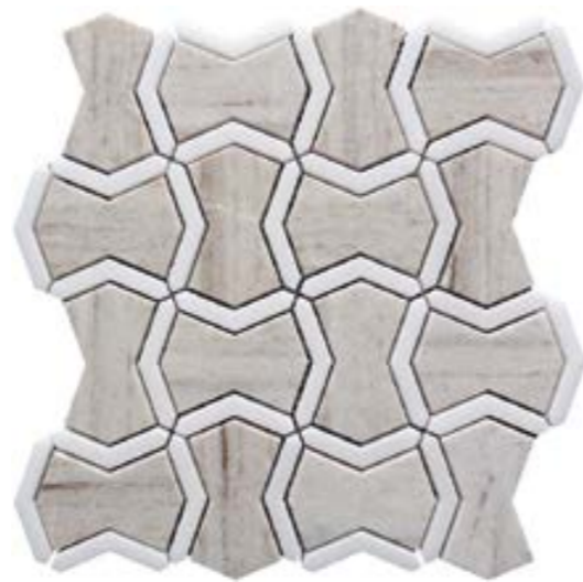
MAGHREB Code: SAH-IR05

Sheet size: 287x318 mm Material: Crystal Sand polished