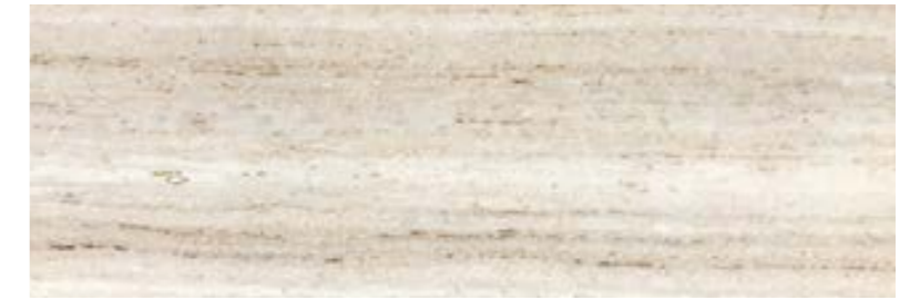
CRYSTAL SAND 4x12 POLISHED Code: FSH-412P Size: 100x305 mm Material: Crystal Sand polished