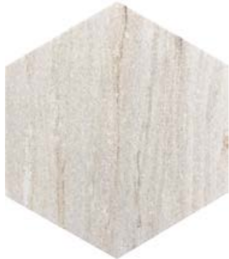
NADURA Code: SAH-G38