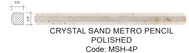
CRYSTAL SAND METRO PENCIL POLISHED Code: MSH-4P