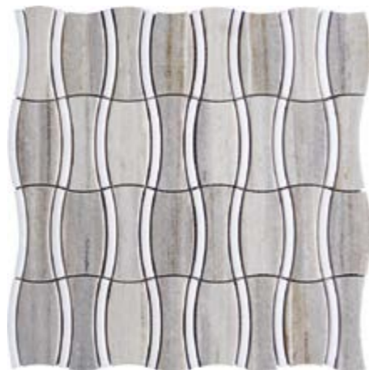
HIBIS Code: SAH-W03

Sheet size: 310x325 mm Material: Crystal Sand / Thassos White polished