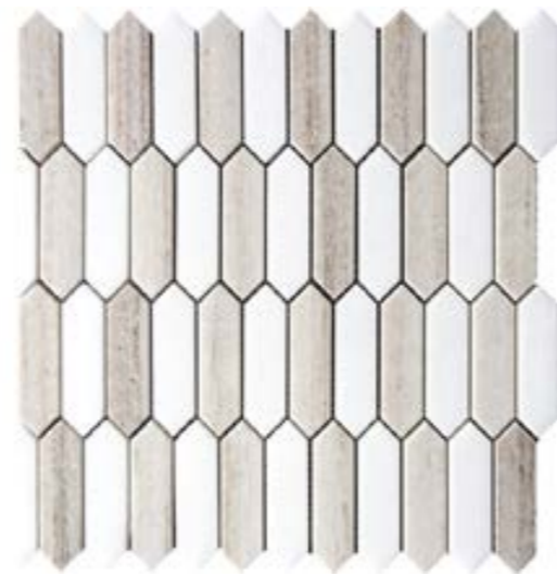
TRIPOLI Code: SAH-G40

Sheet size: 277x277 mm Material: Crystal Sand/Carrara gray / Thassos white