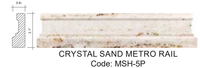
CRYSTAL SAND METRO RAIL Code: MSH-5P