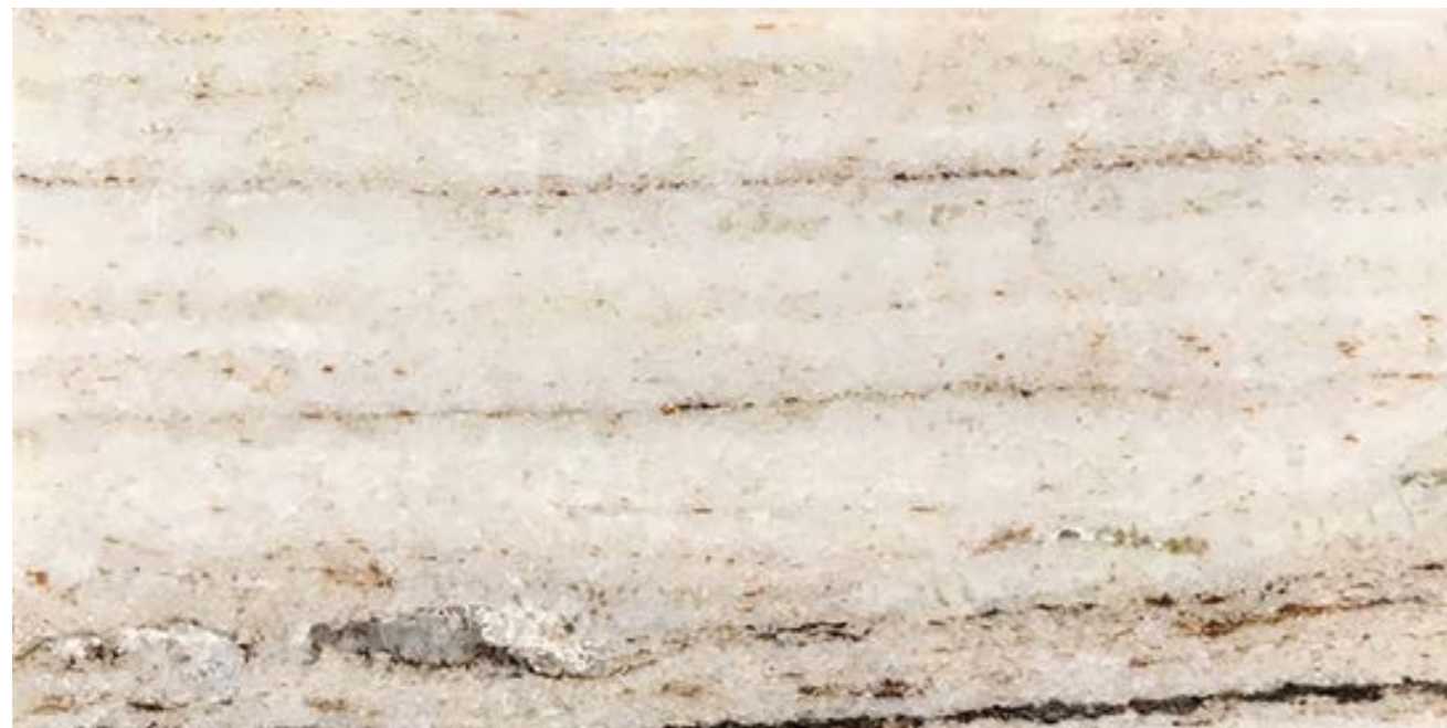
CRYSTAL SAND 12x24 HONED Code: FSH-1224H