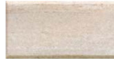
CRYSTAL SAND 3x6 POLISHED AND BEVELED Code: FSH-36BP