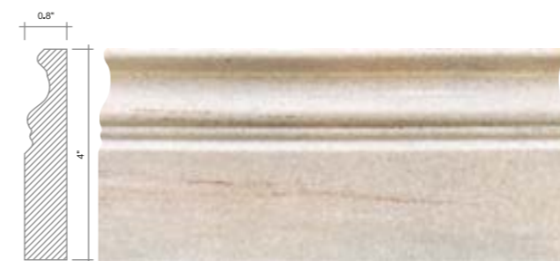
CRYSTAL SAND BASEBOARD POLISHED Code: MSH-3P