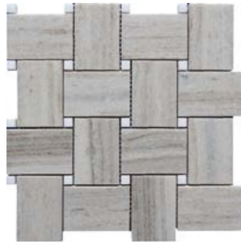
SAHEL Code: SAH-B36

Sheet size: 254x254 mm Material: Crystal Sand honed