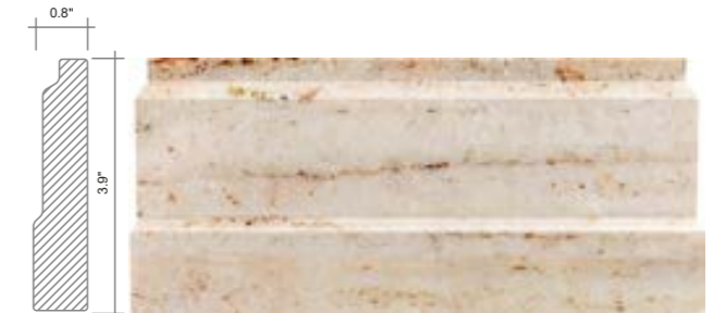
CRYSTAL SAND METRO BASE Code: MSH-6P