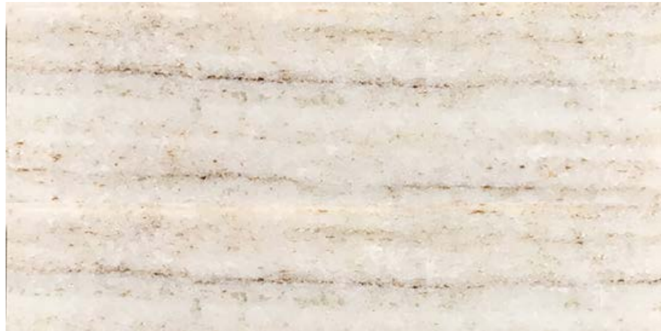
CRYSTAL SAND 12x24 POLISHED Code: FSH-1224P

Tie the whole room together with our field tile and moldings! With an array of marble to choose from, you'll find everything you need to give any space a polished (or honed!) look.