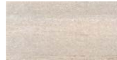
CRYSTAL SAND 3x6 POLISHED Code: FSH-36P