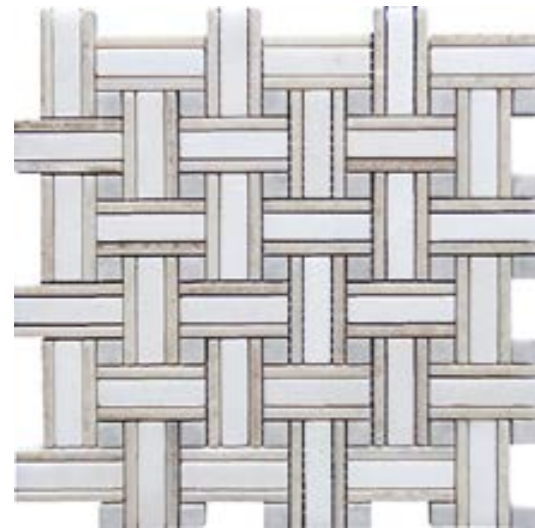
OASIS Code: SAH-B37

Sheet size: 277x277 mm Material: Crystal Sand / Thassos White