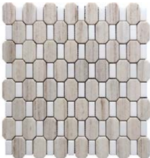
TIBESTI Code: SAH-OC02

Sheet size: 244x310 mm Material: Crystal Sand / Thassos White / Cinderella Gray