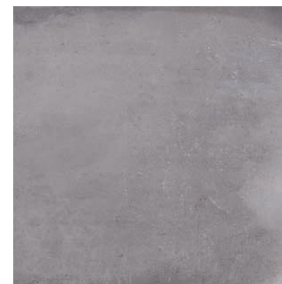
HARLEM SILVER 59,6x59,6x1,1 cm P1856922 / 100145388 G354

Butech recomienda junta / Butech recommends joint: Colorstuk Rapid n Cemento B21522249/100236449