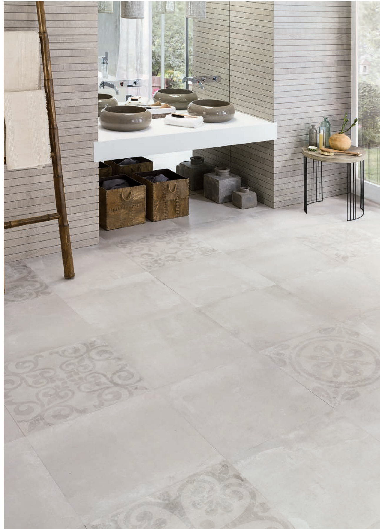
PAVIMENTO: HARLEM CALIZA 59,6x59,6cm - DECO HARLEM CALIZA 59,6x59,6cm | REVESTIMIENTO: LISTÓN OXFORD ACERO 31,6x90cm