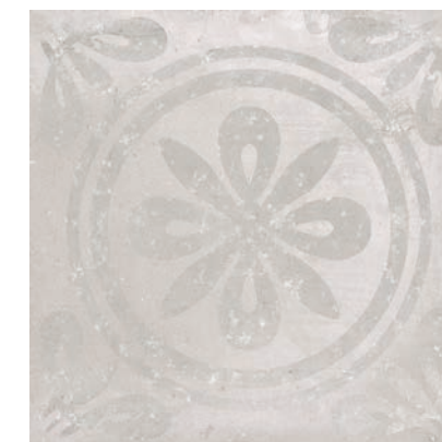
DECO HARLEM CALIZA 59,6x59,6x1,1 cm P1856925 / 100145530 G359

Butech recomienda junta / Butech recommends joint: Colorstuk Rapid n Cemento B21522249/100236449