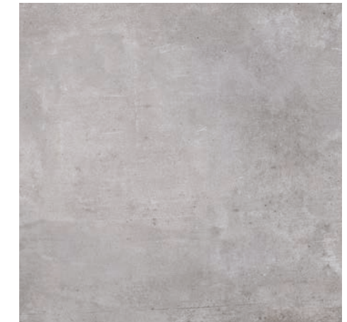
HARLEM ACERO 120x120 cm P9201793 / 100229348 80x80x1,2 cm P1760062 / 100145836 59,6x59,6x1,1 cm P1856923 / 100145386

Butech recomienda junta / Butech recommends joint: Colorstuk Rapid n Manhattan B21522248/100236464