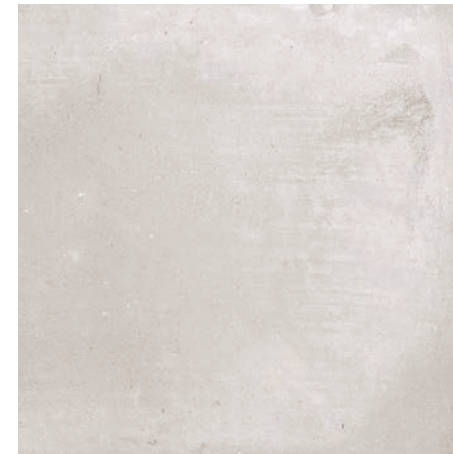
HARLEM CALIZA 80x80x1,2 cm P1760061 / 100145837 59,6x59,6x1,1 cm P1856920 / 100145387

Butech recomienda junta / Butech recommends joint: Colorstuk Rapid n Gris B21522258/100236834