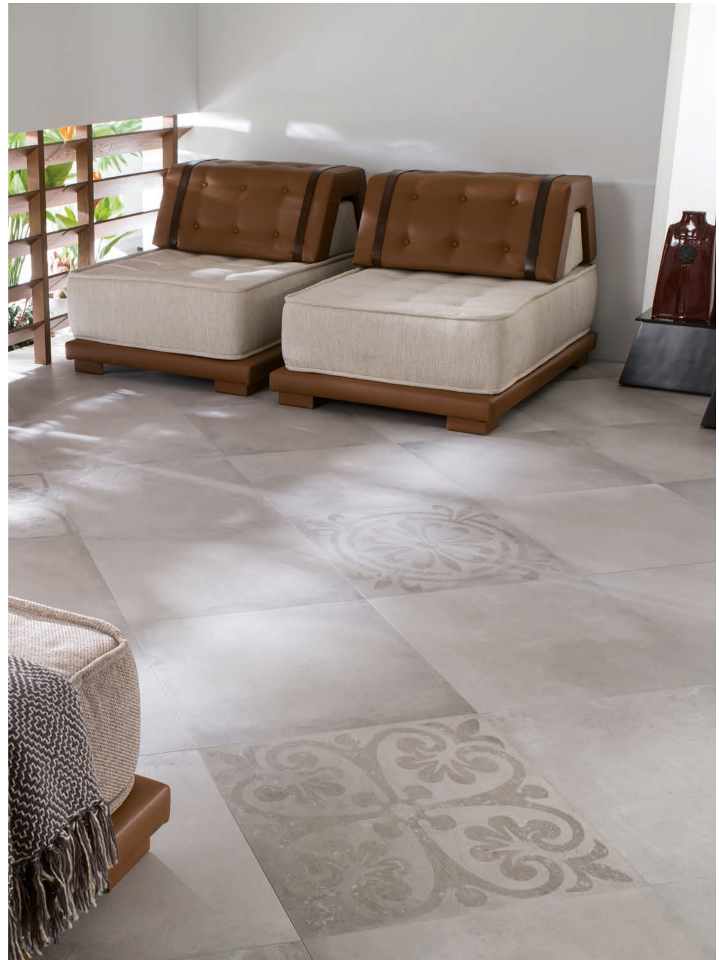
PAVIMENTO: HARLEM ACERO 59,6x59,6cm - DECO HARLEM ACERO 59,6x59,6cm