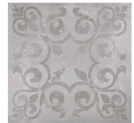
DECO HARLEM ACERO 59,6x59,6x1,1 cm P1856926 / 100145489 G359

Butech recomienda junta / Butech recommends joint: Colorstuk Rapid n Gris B21522258/100236834