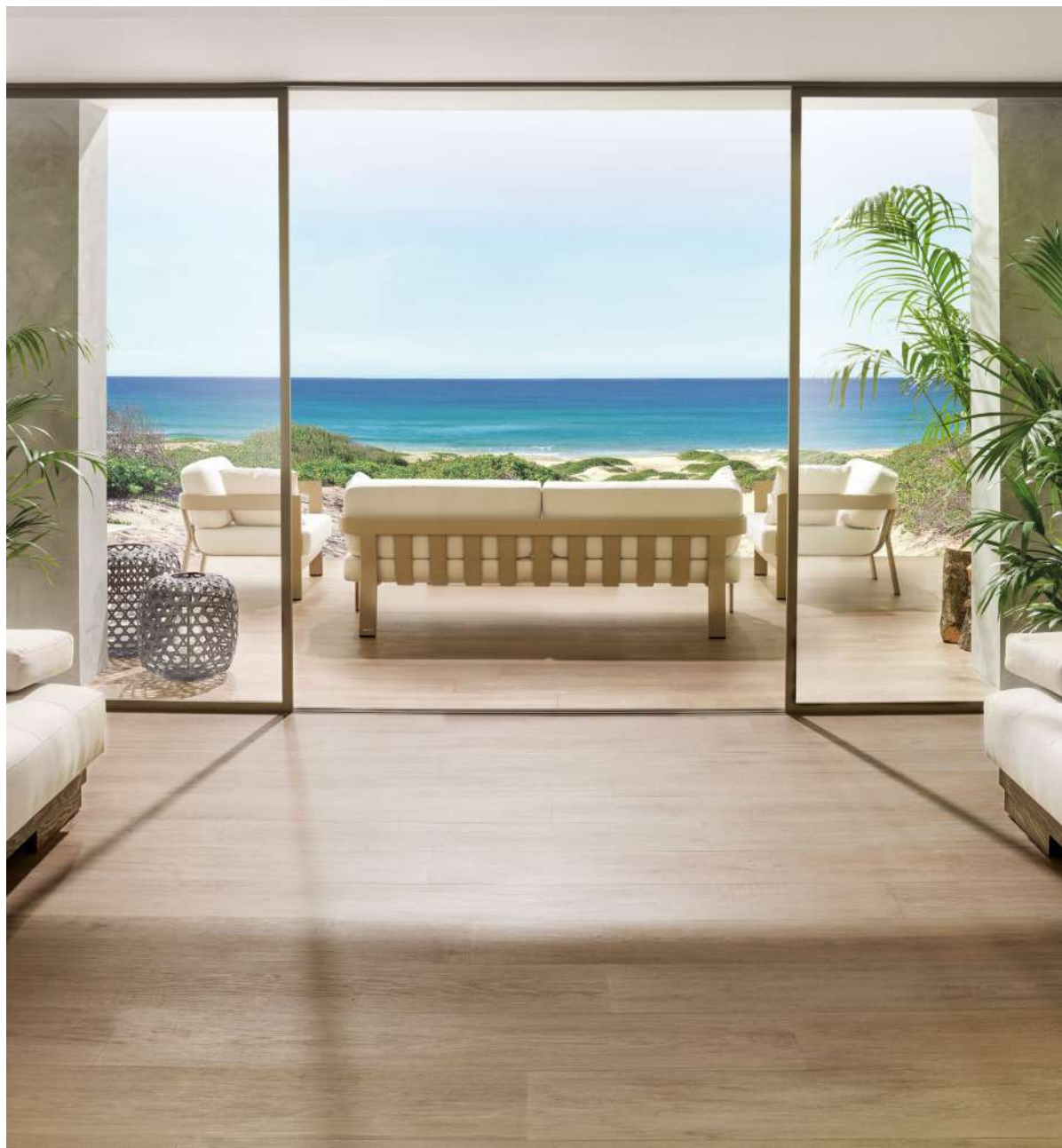
Suelo / Floor Tanzania Nut 25x150 cm & Tanzania Nut Outdoor 25x150 cm