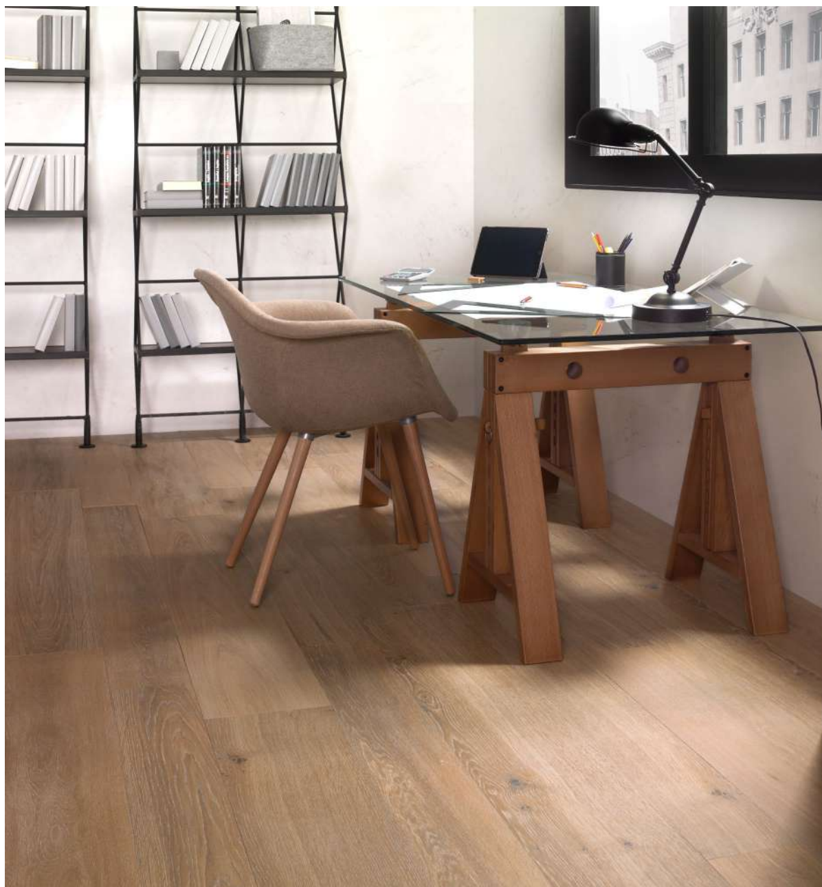
Pared / Wall Rivoli 33.3x100 cm Suelo / Floor Tanzania Almond 25x150 cm & Tanzania Almond 16.5x150 cm