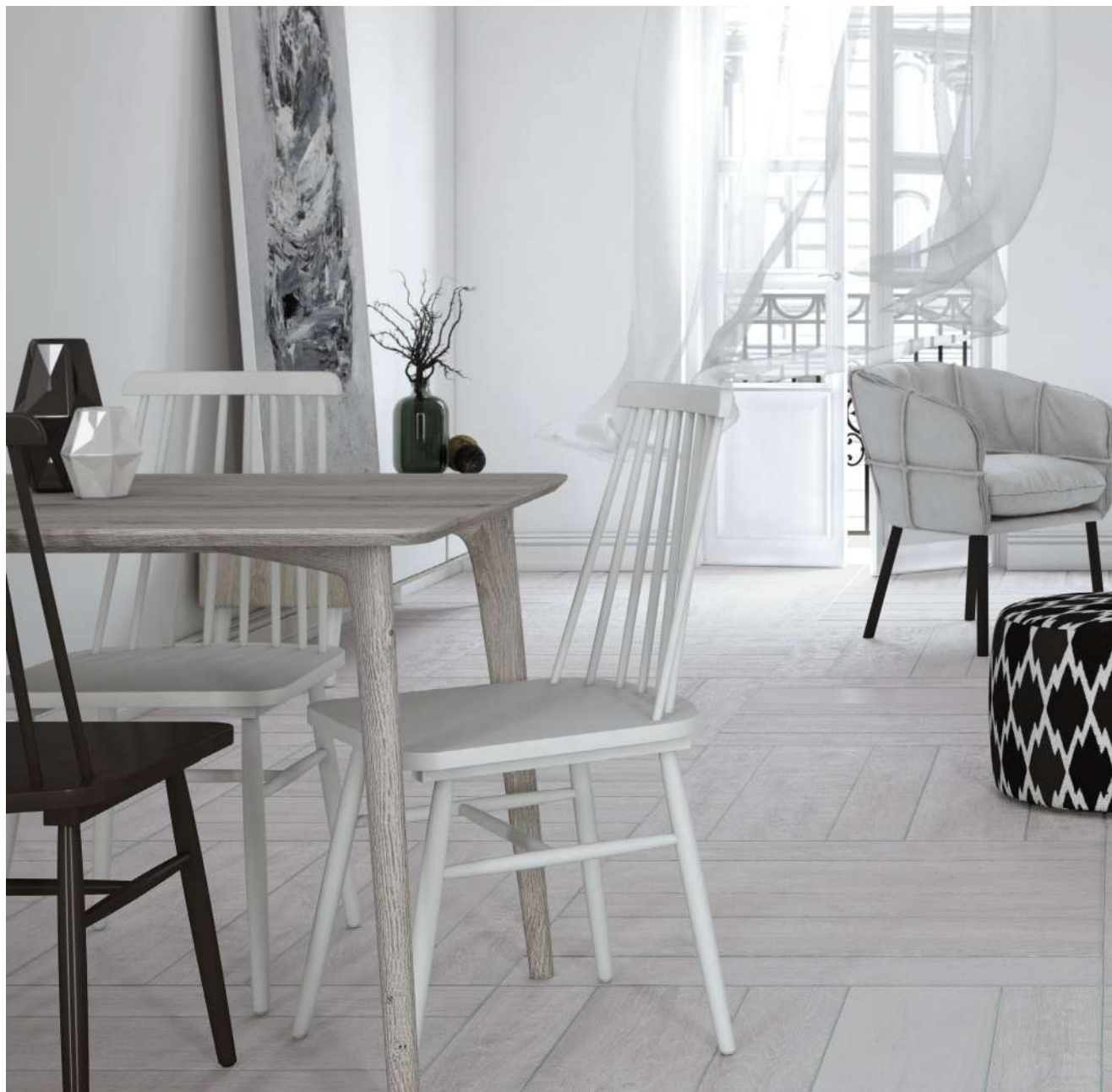
Suelo / Floor Smart Tanzania White 22x90 cm & Smart Tanzania White 14.3x90 cm