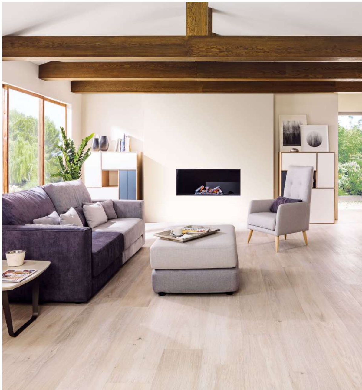
Pared / Wall Tanzania White 25x150 cm Suelo / Floor Tanzania White 25x150 cm