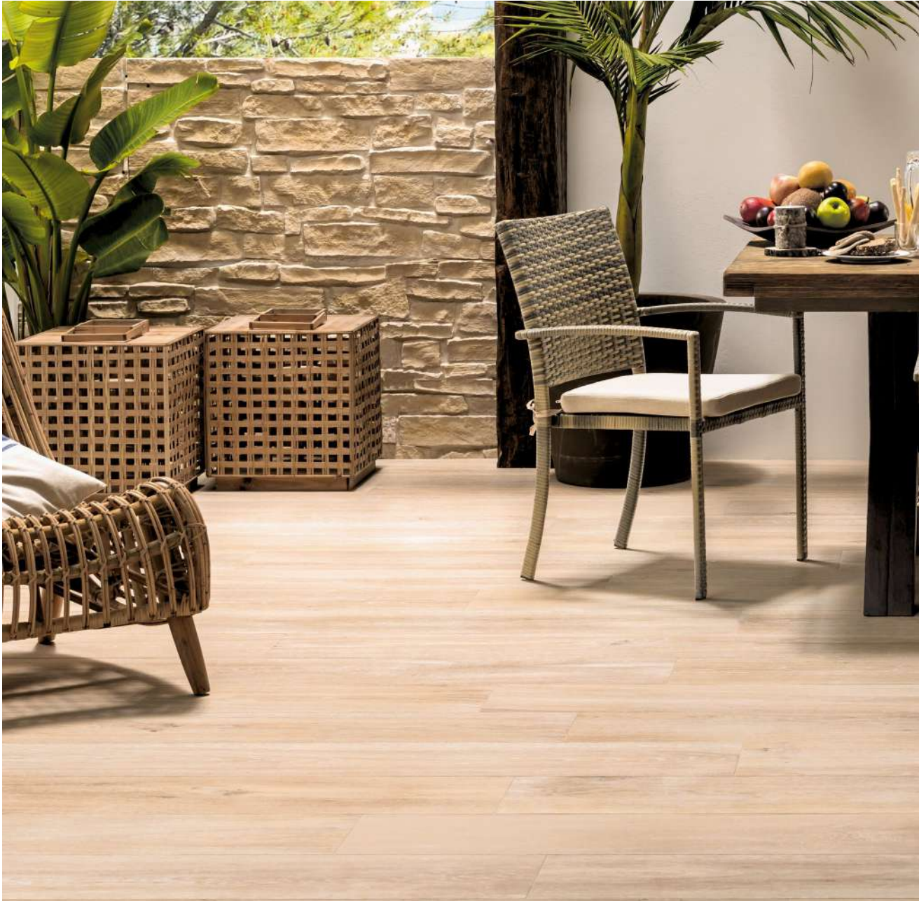
Suelo / Floor Tanzania Taupe 25x150 cm