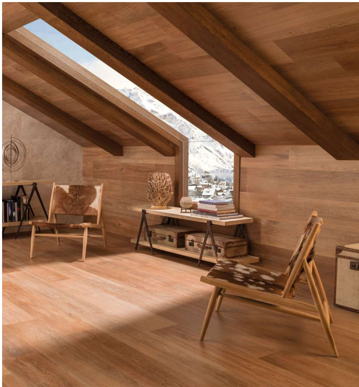
Pared / Wall Tanzania Walnut 25x150 cm & Mirage Cream 33,3x100 cm Suelo / Floor Tanzania Walnut 25x150 cm