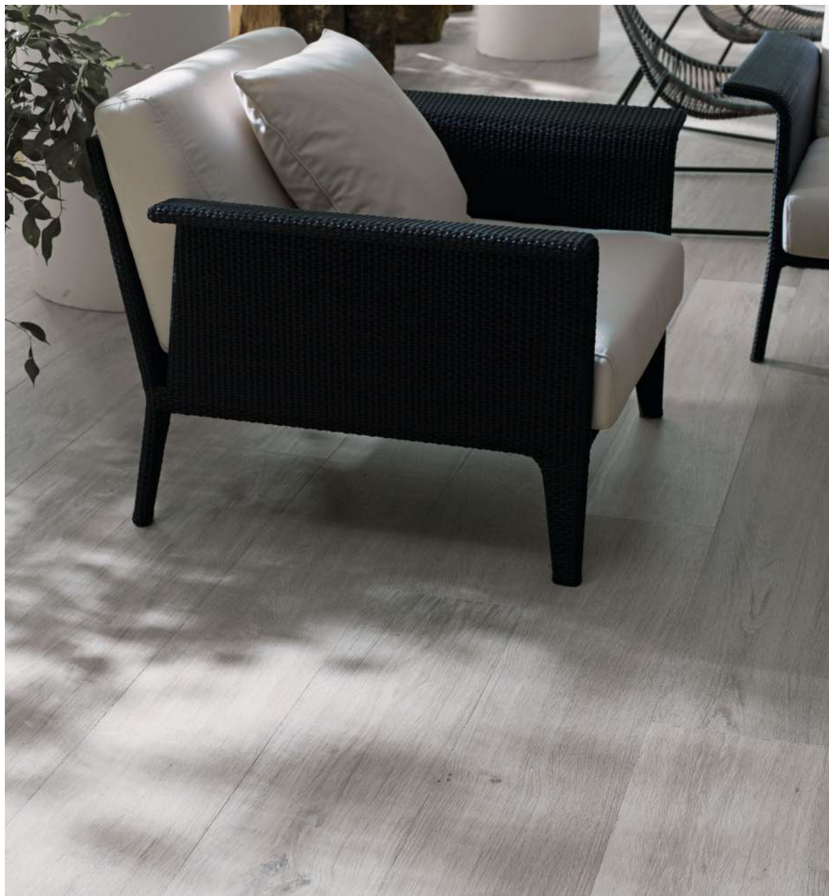
Suelo / Floor Tanzania Silver 25x150 cm