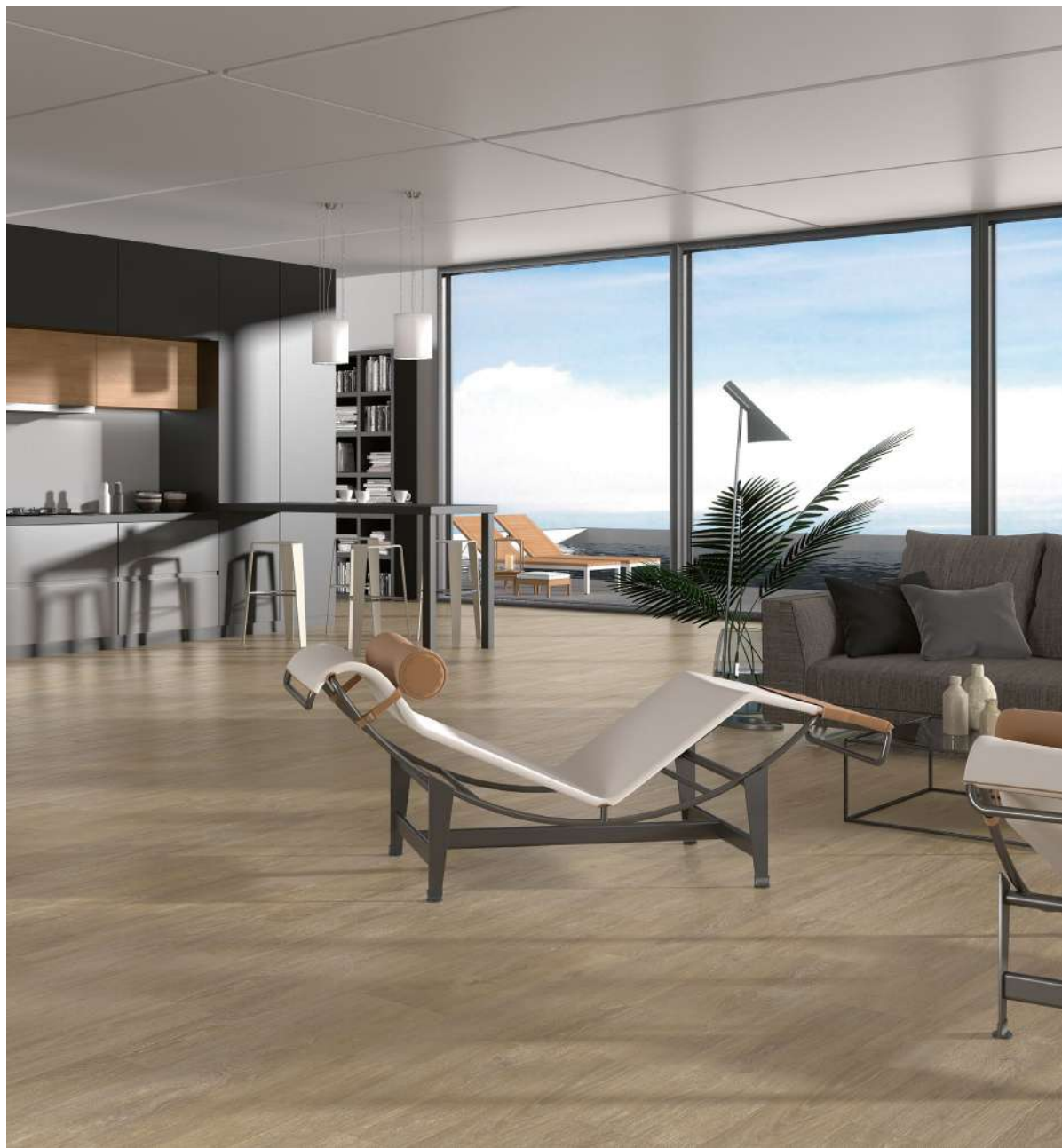
Suelo / Floor Smart Tanzania Natural 22x90 cm