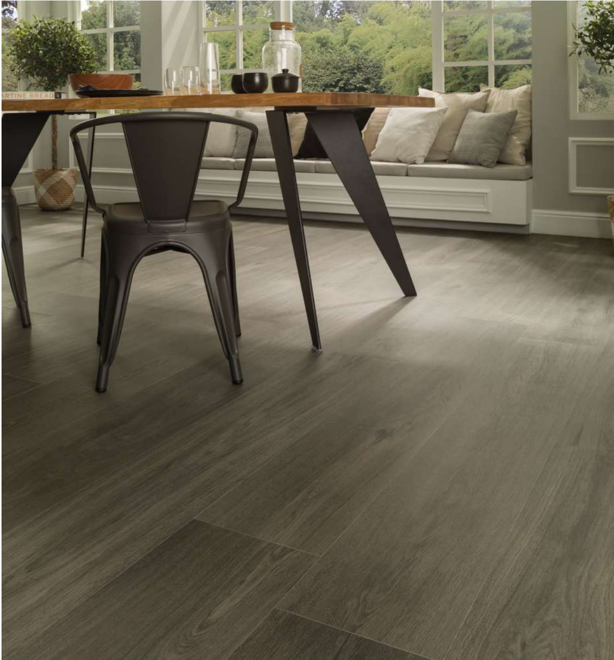
Suelo / Floor Tanzania Graphite 25x150 cm