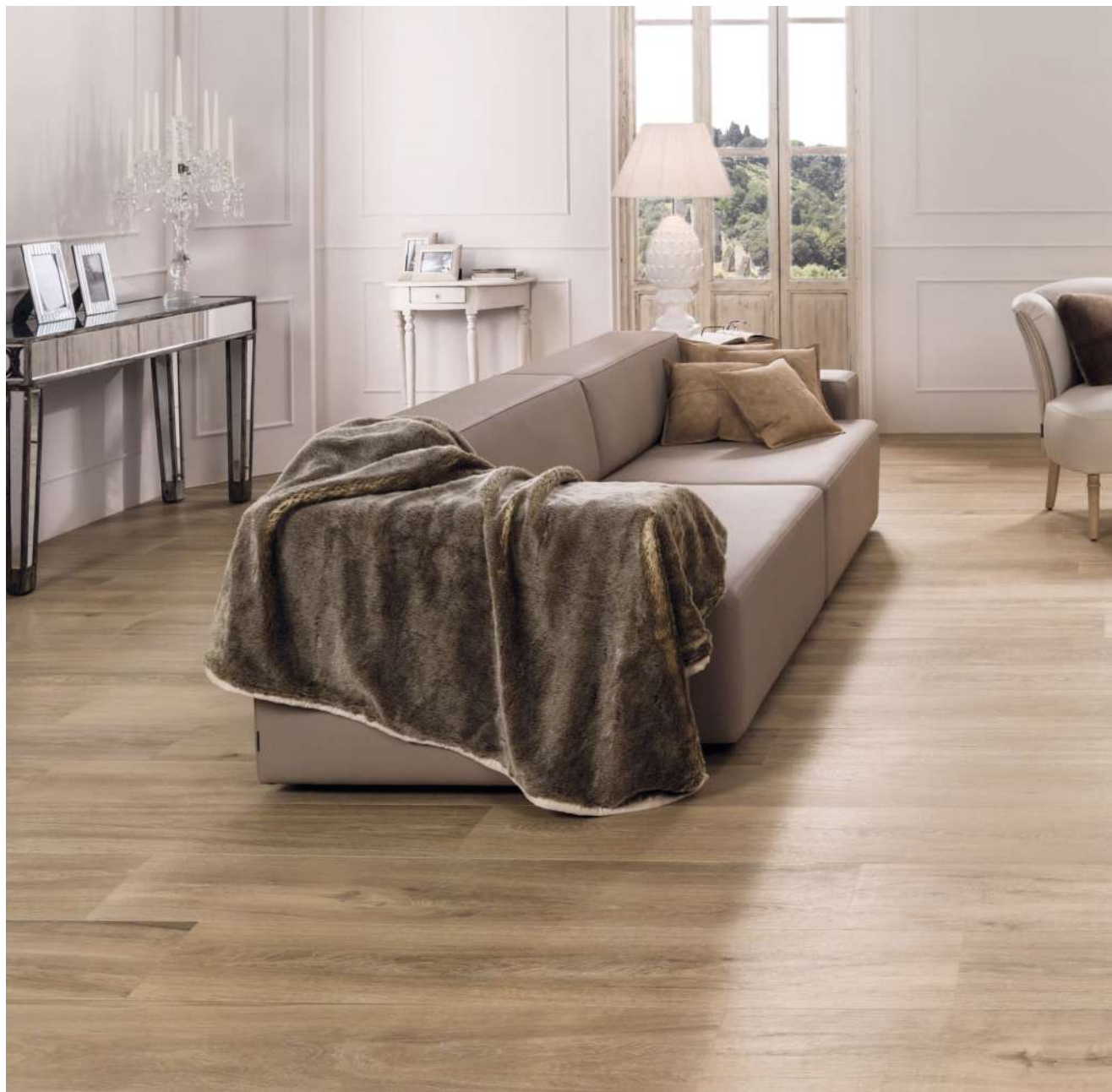
Suelo / Floor Tanzania Almond 25x150 cm