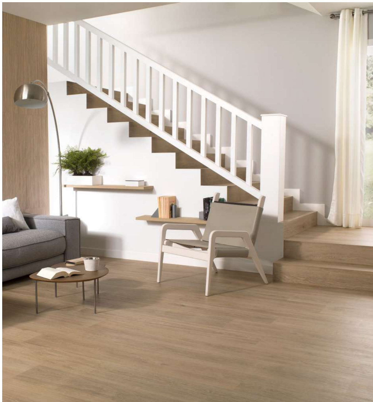
Pared / Wall Ice Tanzania Nut 45x120 cm Suelo / Floor Tanzania Nut 25x150 cm