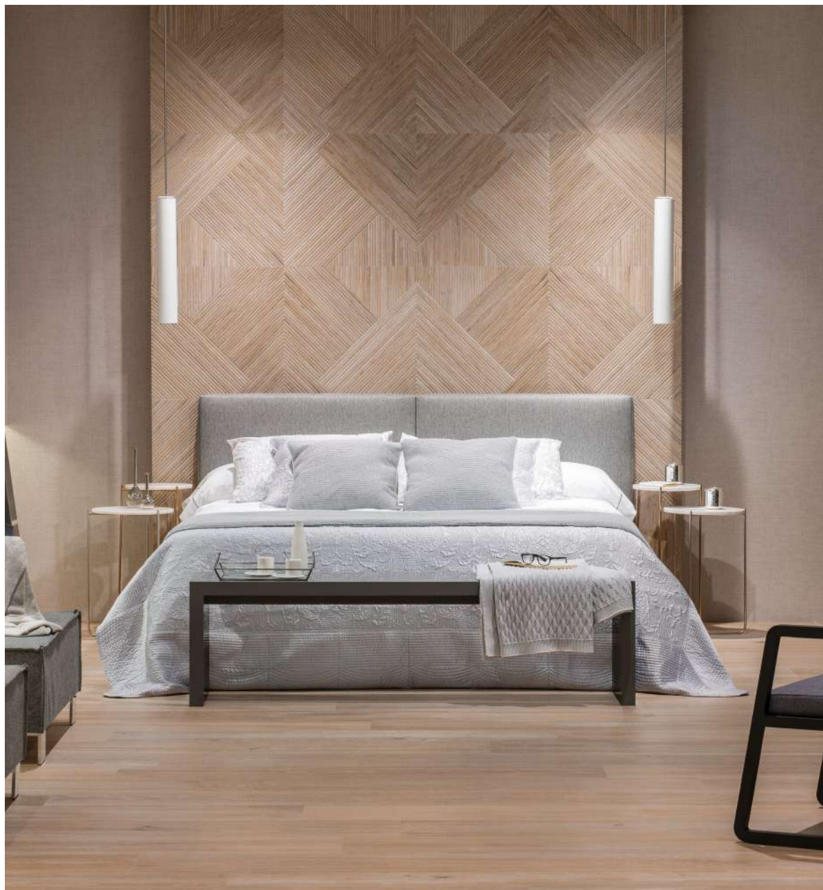
Pared / Wall Noa Tanzania Wine 59.6x59.6 cm Suelo / Floor Tanzania Wine 25x150 cm & Tanzania Wine 16.5x150 cm