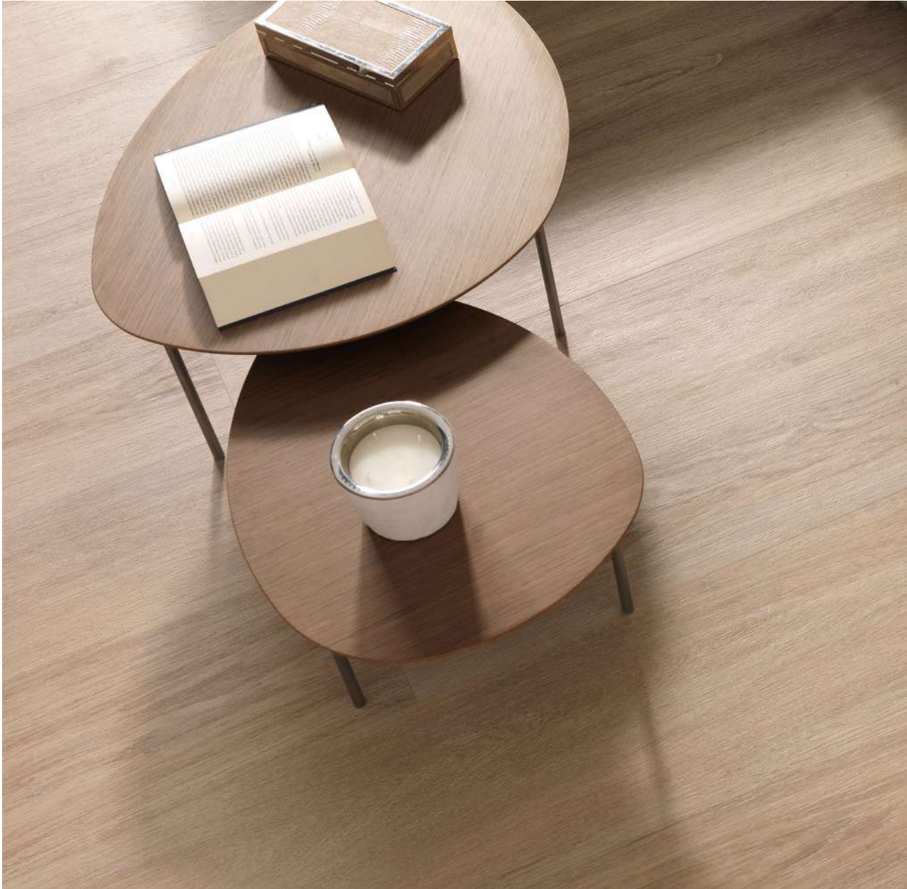
Suelo / Floor Tanzania Nut 25x150 cm