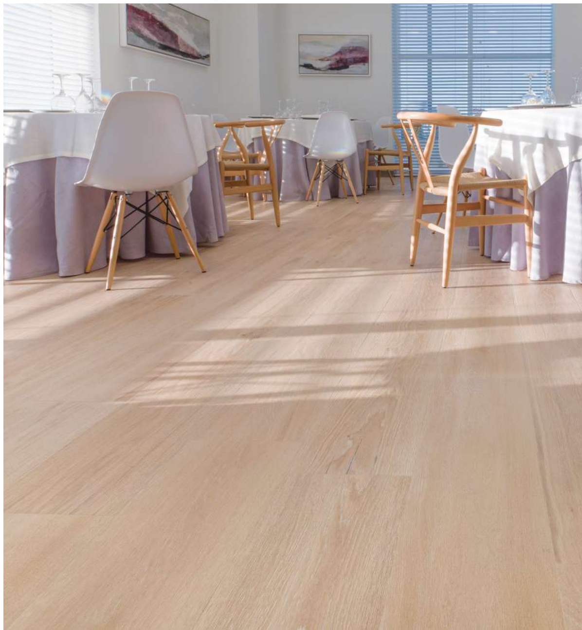
Suelo / Floor Tanzania Taupe 25x150 cm