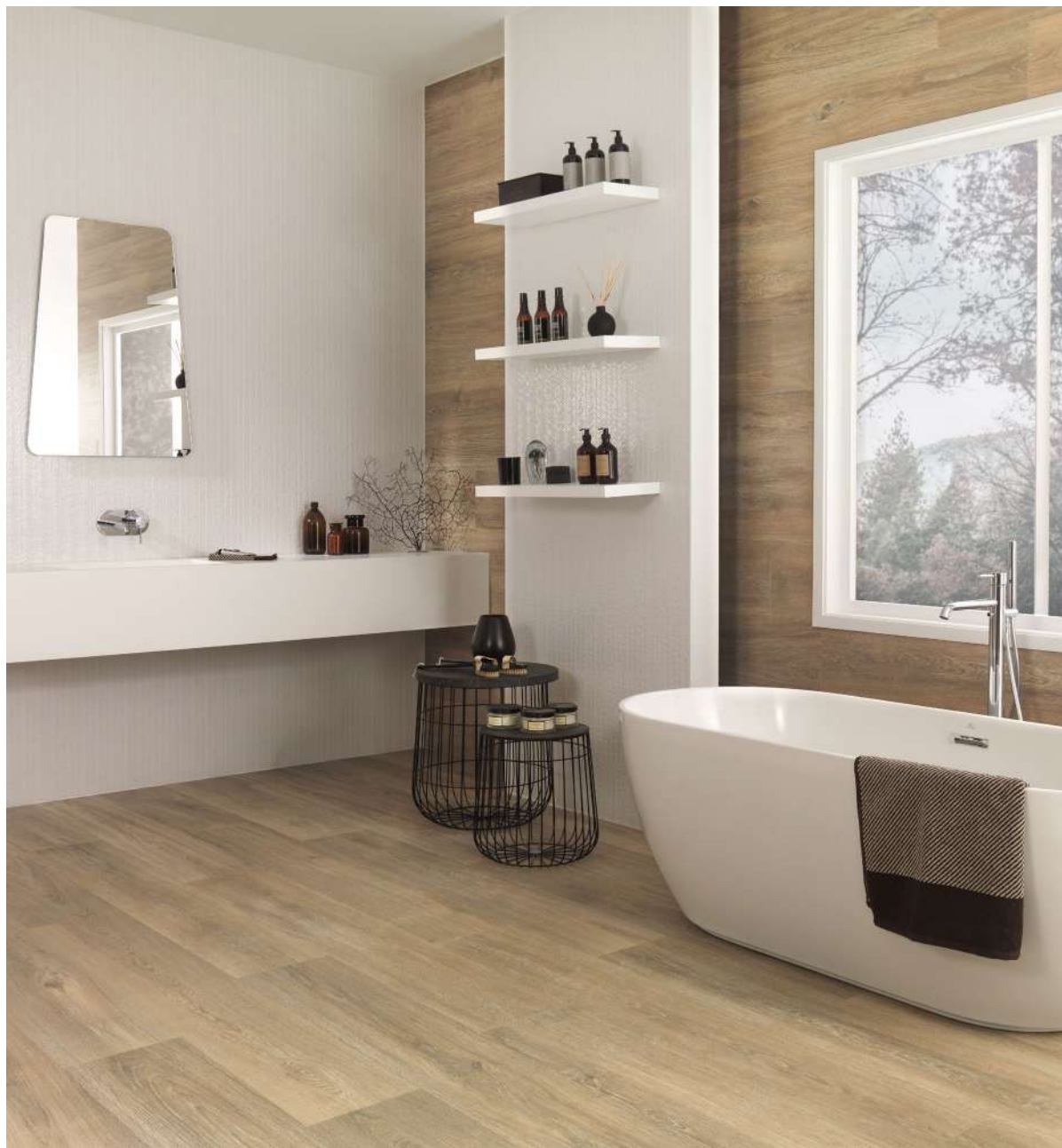
Pared / Wall Tanzania Natural 25x150 cm & Sydney Pearls 33.3x100 cm Suelo / Floor Tanzania Natural 25x150 cm