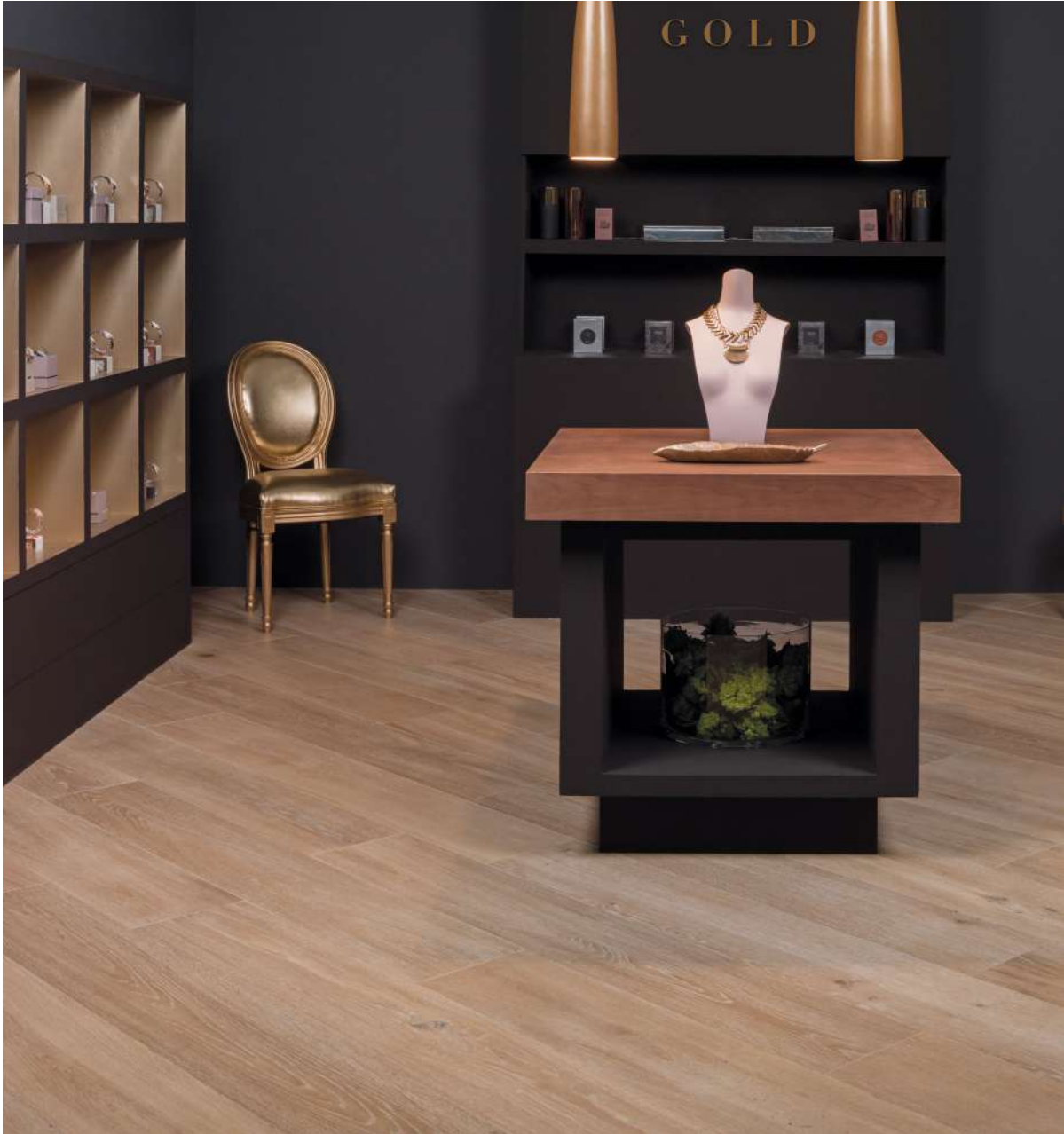
Suelo / Floor Tanzania Wine 25x150 cm