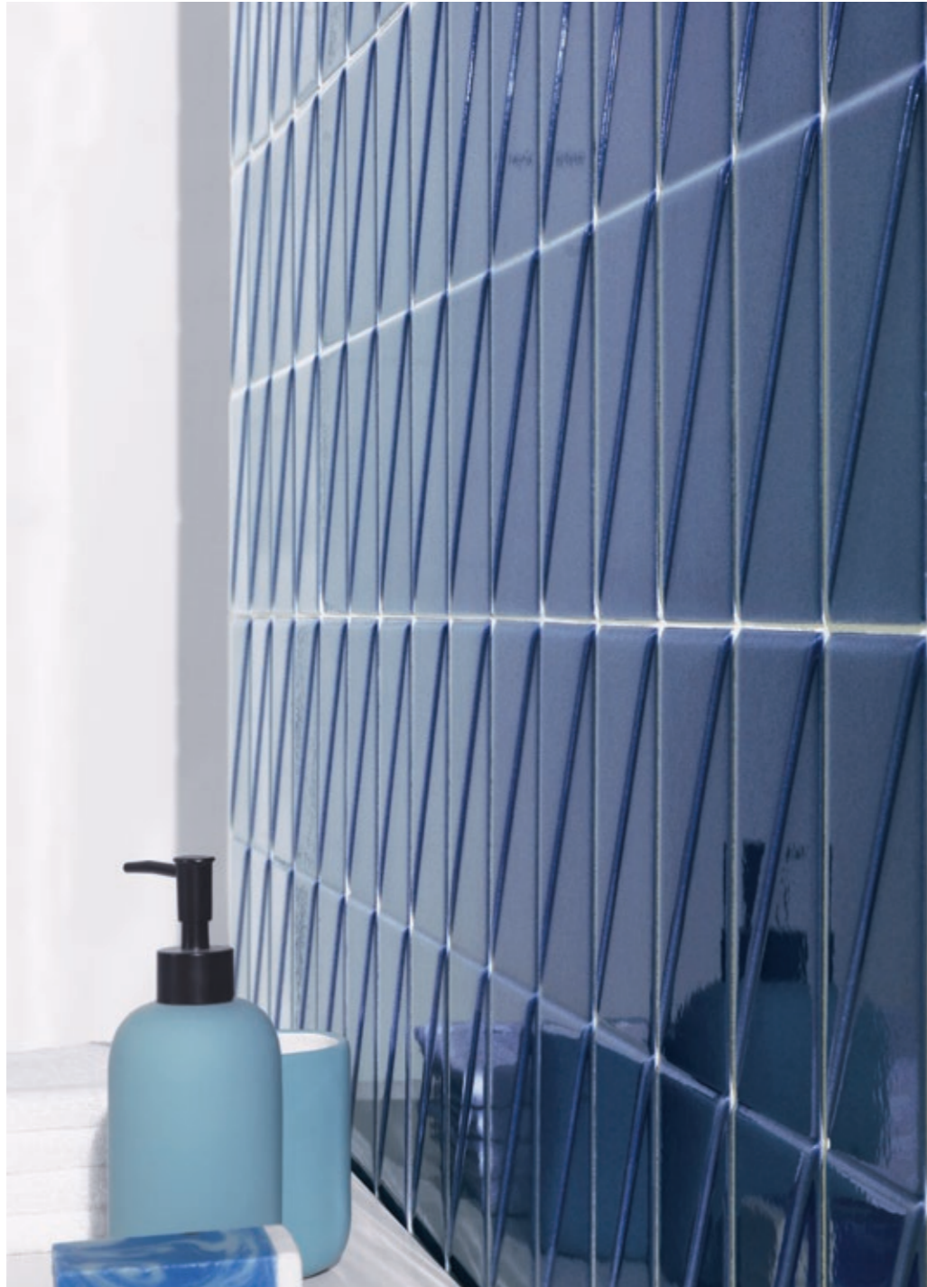
> Wall / Brick Denim 7,5x30