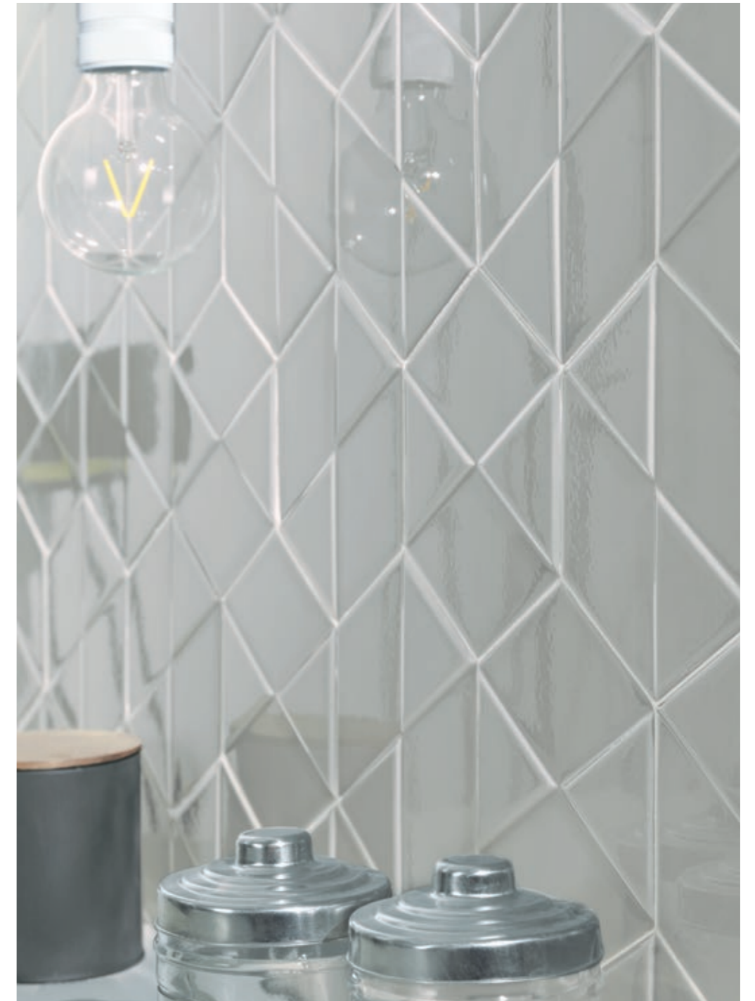
> Wall / Brick Smoke 7,5x30 / Esagona Smoke 15,6x18