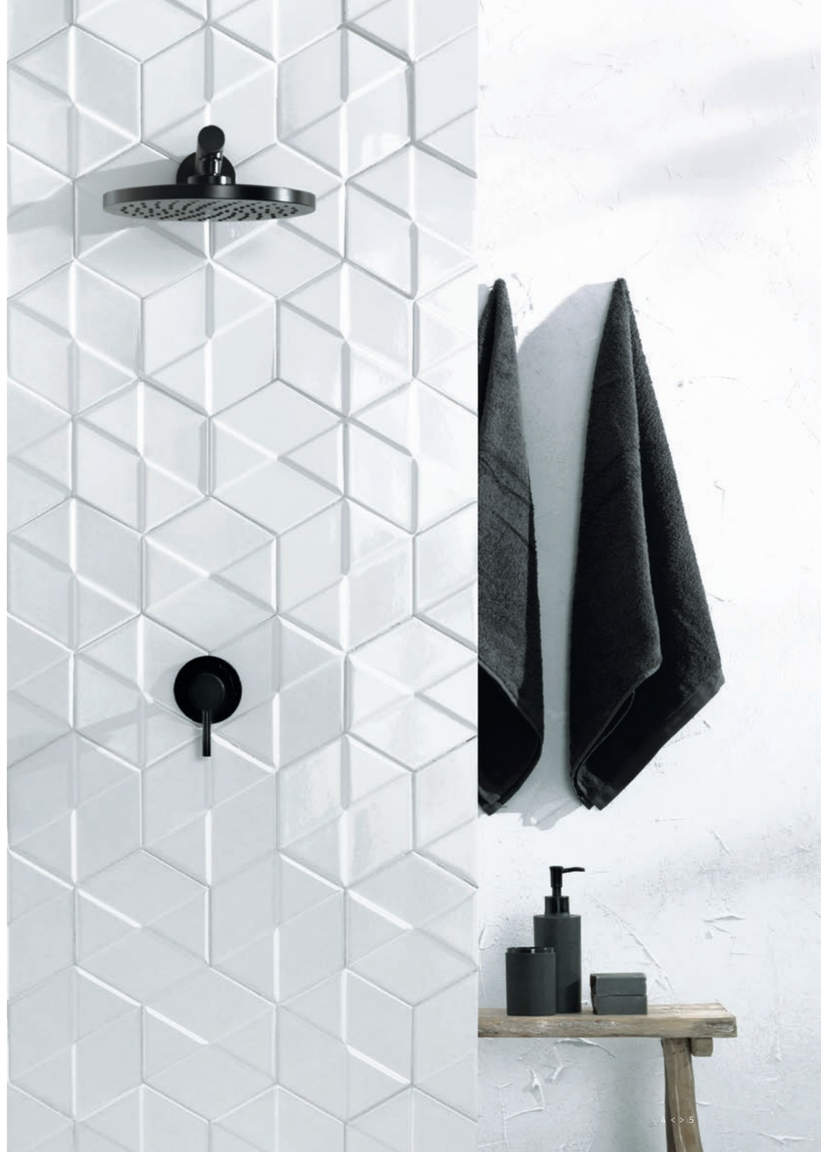
> Wall / Brick Bright White 7,5x30 / Esagona Bright White 15,6x18