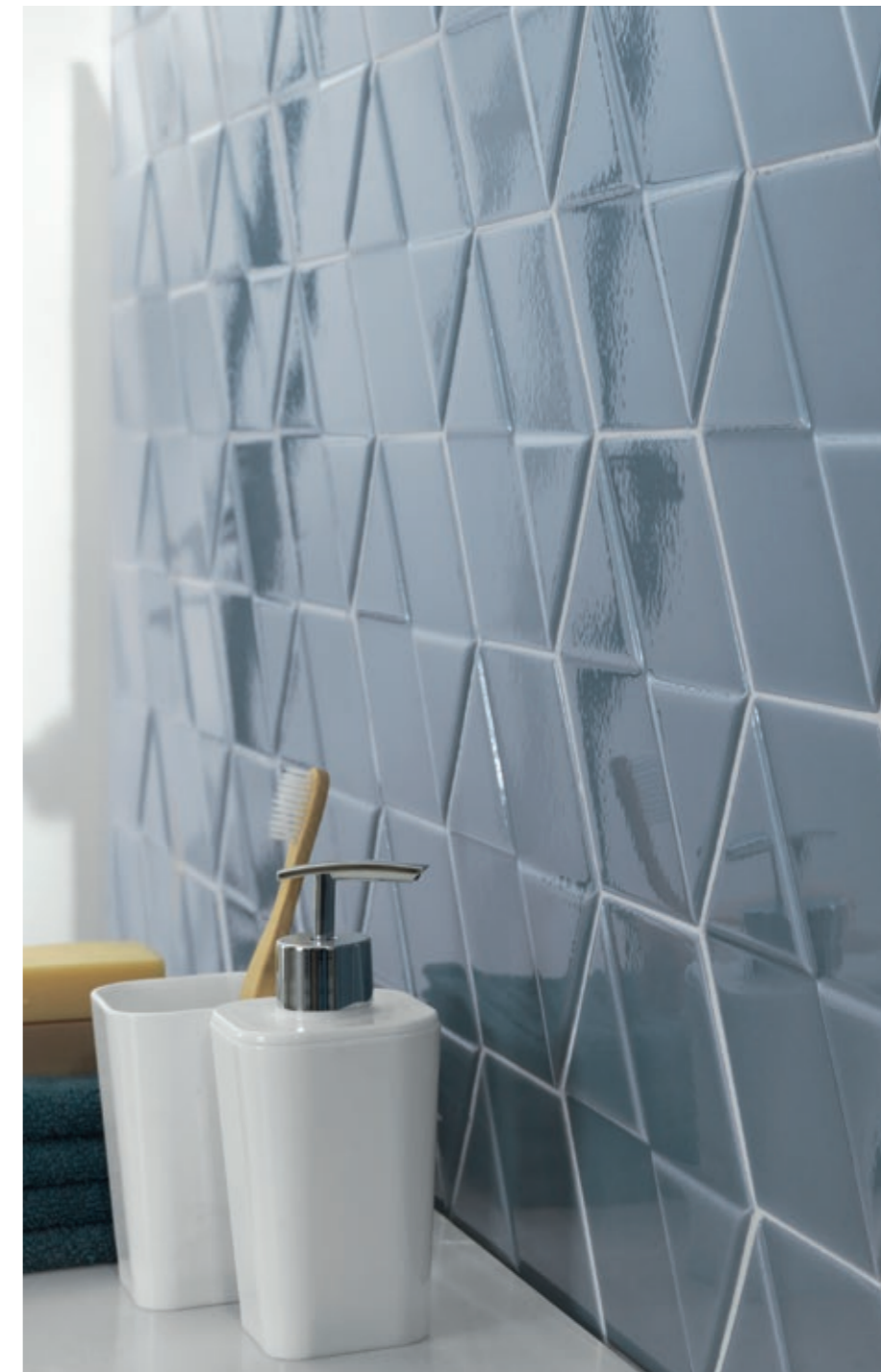
> Wall / Brick Storm 7,5x30 / Esagona Storm 15,6x18