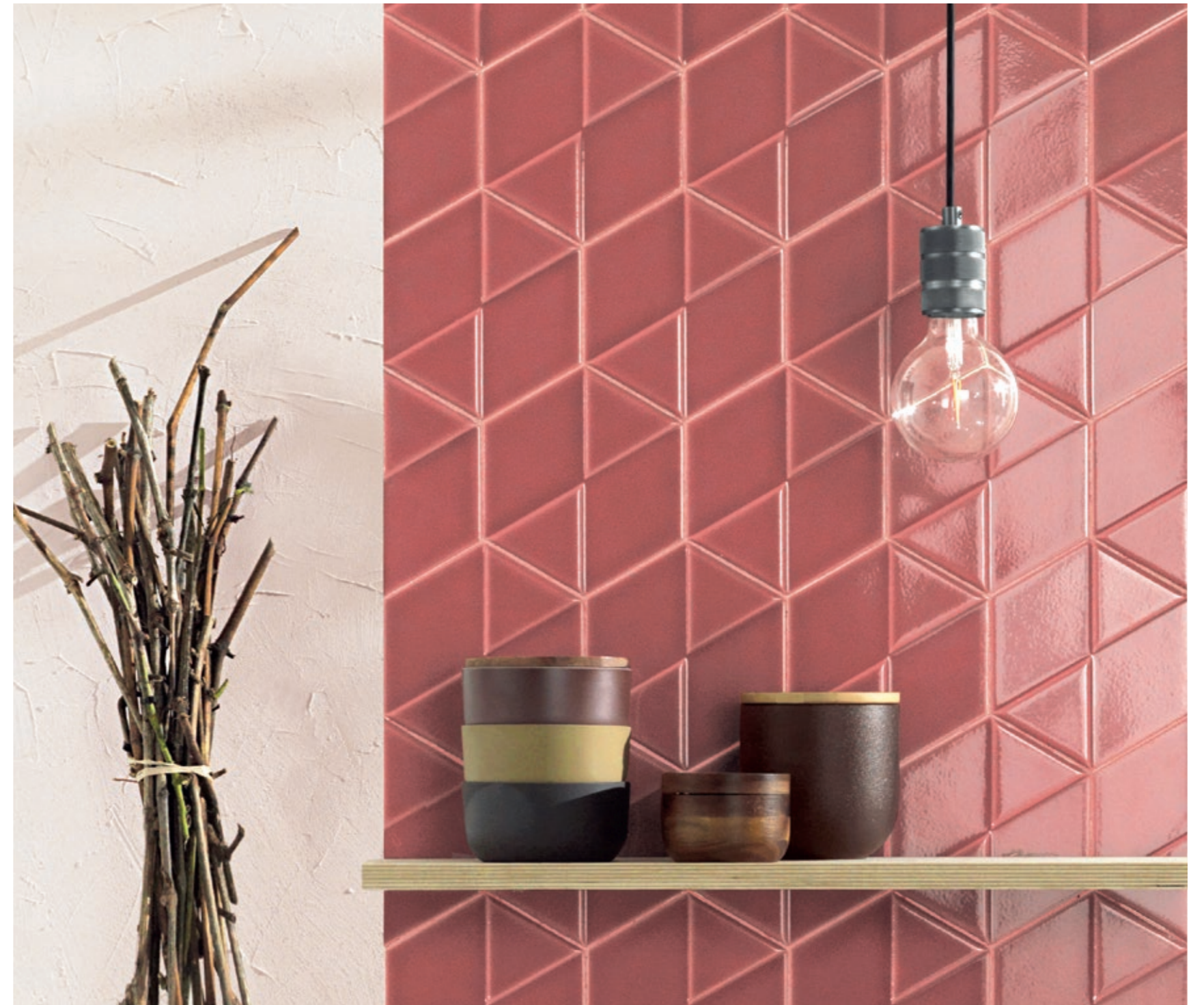
> Wall / Brick Scarlet 7,5x30 / Quarter Round Scarlet 1,2x30