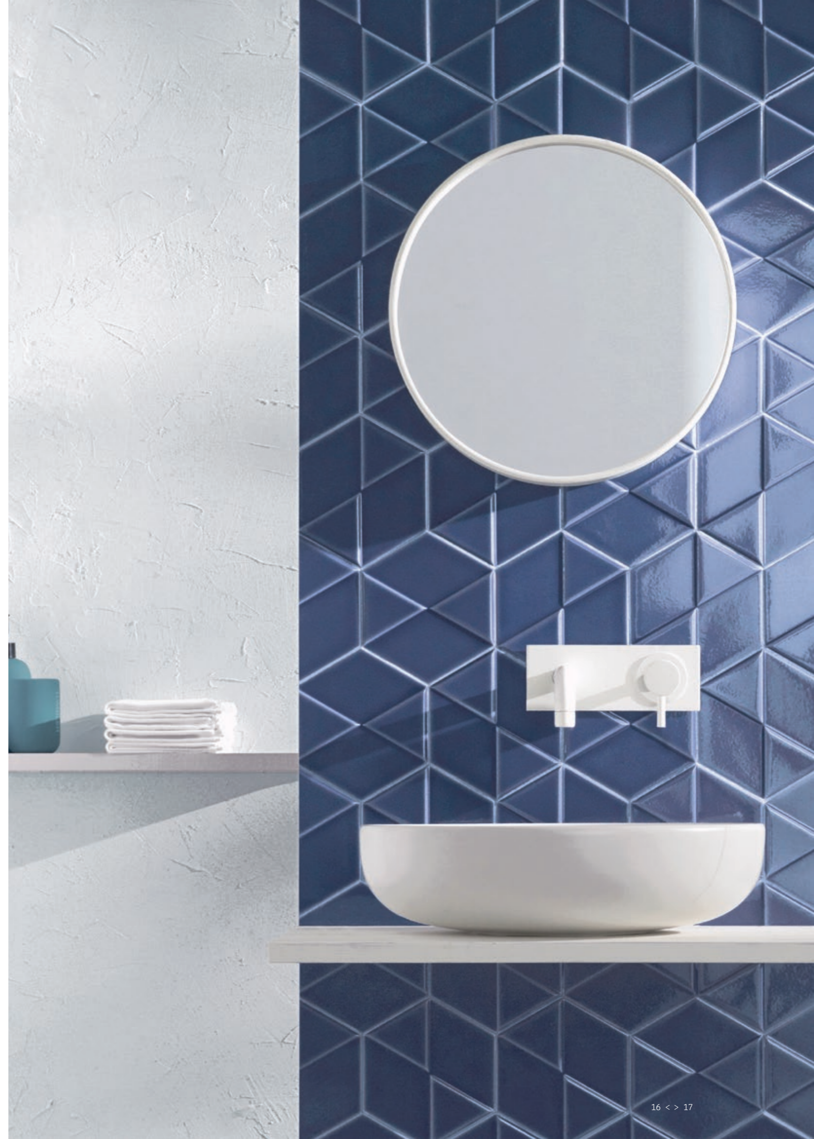
> Wall / Brick Denim 7,5x30 / Esagona Denim 15,6x18