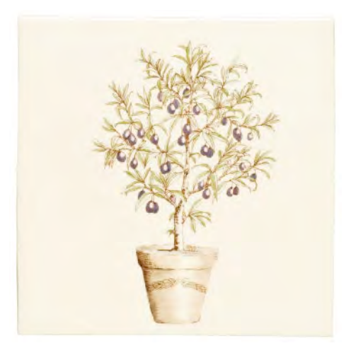
Potted Olive Tree Plaque W.HP1530 258 x 258 x 10mm (10" x 10" x 3/8")

These delightful Olive, Orange and Lemon tiles will bring the warmth and relaxed atmosphere of a Mediterranean garden into your kitchen and even your cuisine.