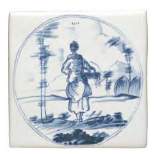
Woman and Basket