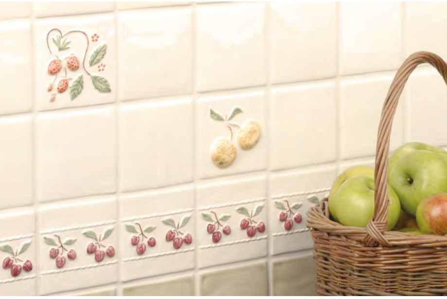
Strawberries and Oranges with Cherry Border, Tarragon and Off White 105 \times 105 \text{mm} field tiles