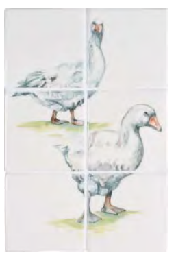
Cuthbert & Gertrude W.1707