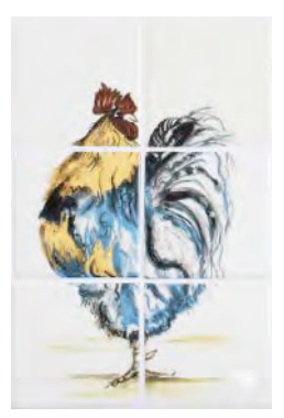
Dutch Chicken W.1709 Off White 6 Tile Panel