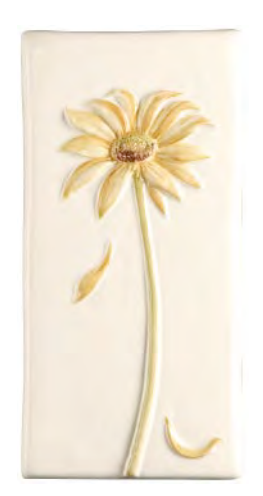
Arctotis W.HP1484 214 × 105 × 10mm (41%" × 83%" × 3%")

Four flowers and four pots provide a number of combinations as a series of stand alone tiles or as a frieze.