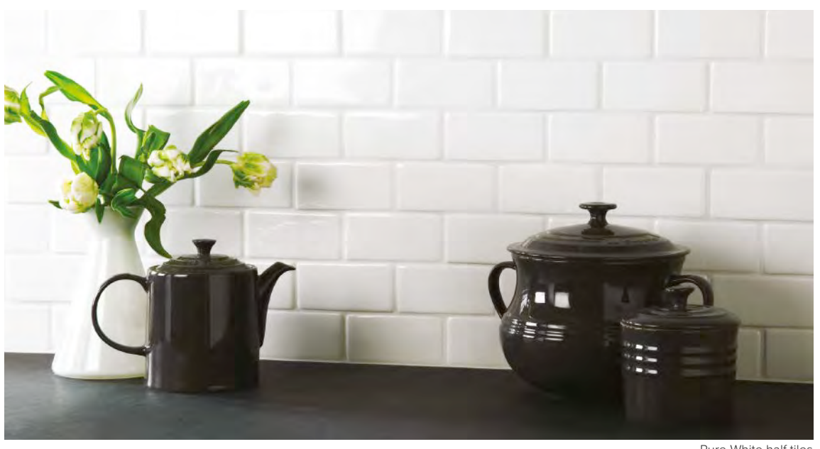
Pure White half tiles