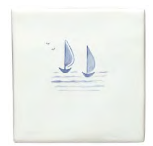
Black Barks of Bristol W.DE1532HP