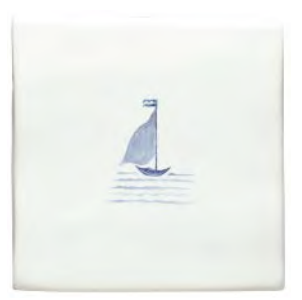
Trinite of London W.DE1527HF