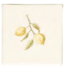
Lemon Sprig Single W.HP1534 127 x 127 x 10mm (5" x 5" x <sup>3</sup>/8")