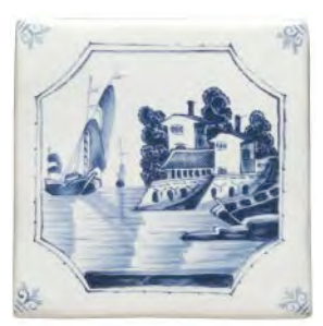
Ship and House W.DE1519HP