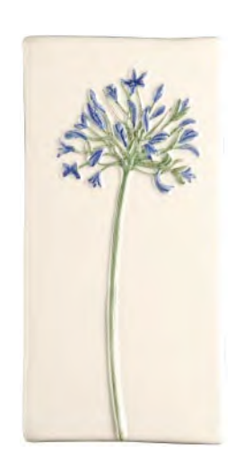
Agapanthus W.HP1486 214 x 105 x 10mm (41/8" x 83/8" x 3/8")