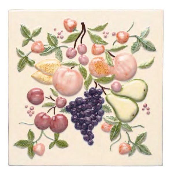
Fruit Plaque W.HP1072N 323 x 323 x 10mm (1211/18" x 1211/18" x 3%")

These tiles are on an Off White background.