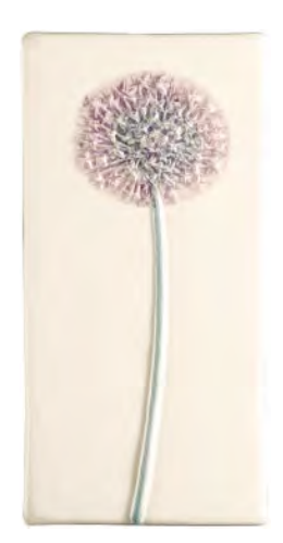
Allium W.HP1487 214 × 105 × 10mm (41/8" × 83/8" × 3/8")