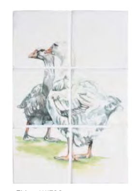
Elders W.1706 Off White 6 Tile Panel

An alternative to chickens and hares: a flock of geese, again available as a 40 tile panel which incorporates the Hedgerow.