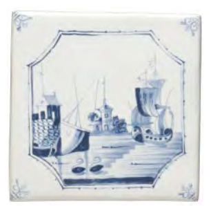
Ship and Island W.DE1518HP