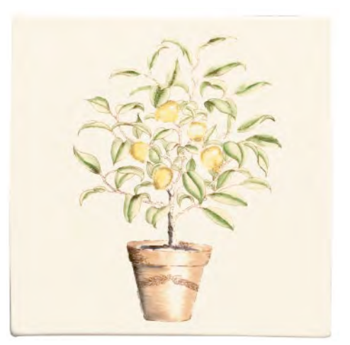
Potted Lemon Tree Plaque W.HP1533 258 x 258 x 10mm (10" x 10" x 3/8")