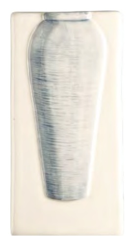
Jar W.HP1489 214 × 105 × 10mm (41/8" × 83/8" × 3/8")