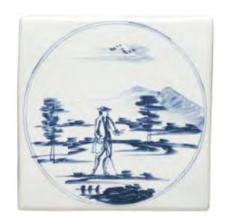
Man with Stick W.DE1513