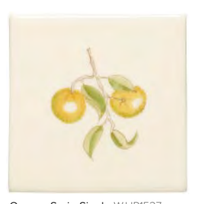
Orange Sprig Single W.HP1537 127 \times 127 \times 10mm (5" \times 5" \times 3/8")