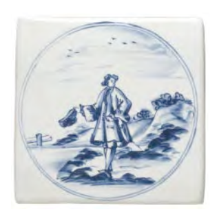
Man with Hat W.DE1510