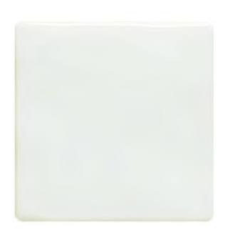
Delft White Field Tile W.DE1005