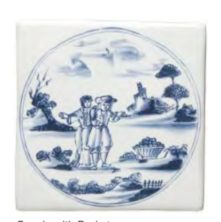
Couple with Basket