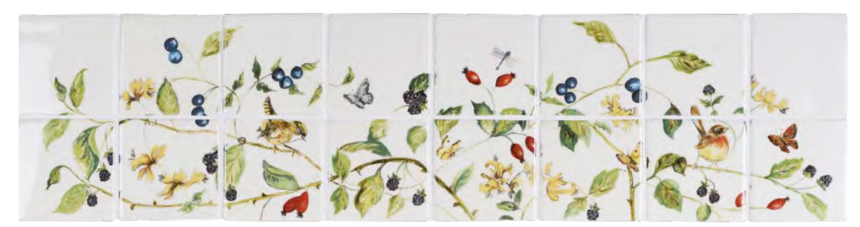
Hedgerow 16 Tile Frieze on Off White W:1713

You'll enjoy finding all the birds, butterflies, berries and flowers within this beautiful Hedgerow, which is available as a 22 tile panel or 16 tile frieze. The frieze can be repeated around a room as a border or as a stand alone in an alcove or above a shelf.