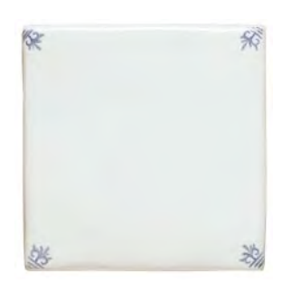
Delft White Blanc with Corners W.DE1001