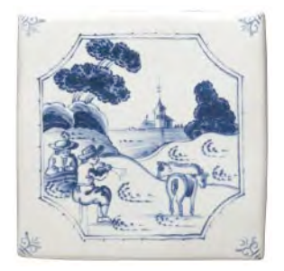
Pastoral Scene W.DE1520HP