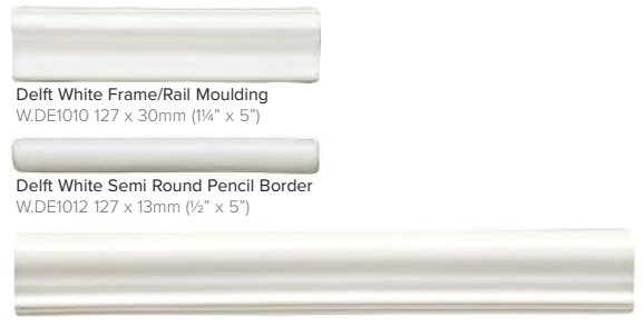
Delft White Dado Rail Moulding W.DE1601 258 \times 38mm (1½" \times 10½")