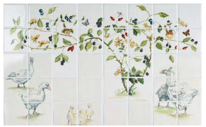
Flock of Geese Panel Colour on Off White 40 Tile Panel W.1704 Available as single panels – as below