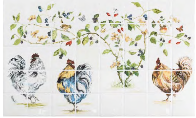
Chicken Coop Colour on Off White 40 Tile Panel W:1708

Here's the next best thing if you would love to keep hens! This beautiful panel can be installed behind a range cooker or as a feature in its 40 tile entirety, made up of three Chickens and a Hedgerow. It is available in a hand finished panel of 127 x 127mm tiles.