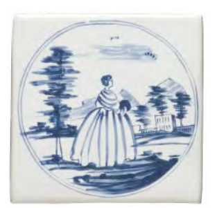
Lady and Mansion