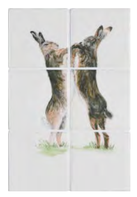
Boxing Hares W.1701