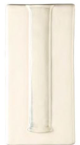
Stem Vase W.HP1490 214 × 105 × 10mm (41/8" × 83/8" × 3/8")