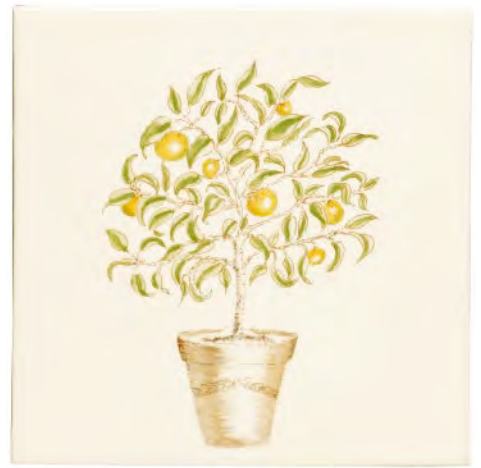
Potted Orange Tree Plaque W.HP1536 258 \times 258 \times 10mm (10" \times 10" \times ^{3}/8 ")