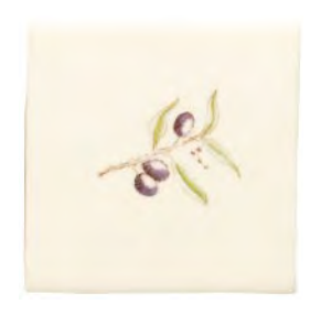
Olive Sprig Single W.HP1531 127 x 127 x 10mm (5" x 5" x <sup>3</sup>/8")