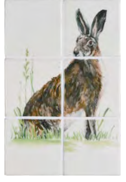
Wise Hare W.1702 Off White 6 Tile Panel