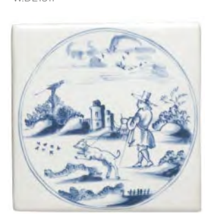
Man with Dog