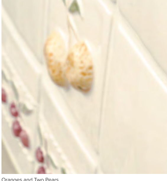
Oranges and Two Pears